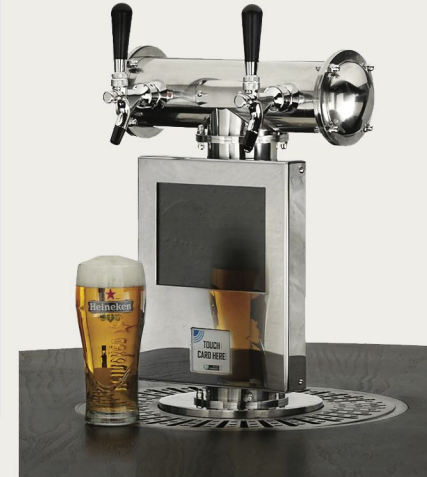
Table mounted towers with 2 self-serve taps per tower, connected via beer python to your cold room kegs. Table taps provide your venue with the ultimate in customer convenience, fun experiences and speed of service.